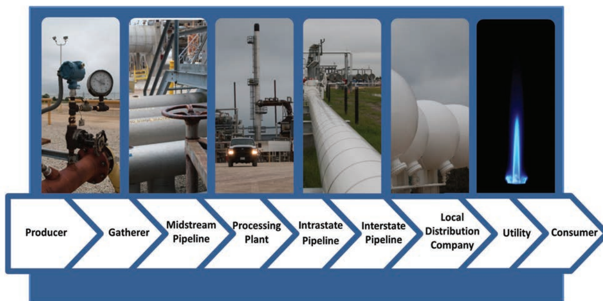
Figure 1.1 Gas industry participants in relative order of the flow of gas

The exploration and production area of natural gas is where the gas is discovered; the wells are drilled; and the gas is brought up from the ground, cleaned through plant processing, and made ready for transportation. Producers, well operators, gatherers, midstream transporters, and plant operators manage these processes. This area of the business is also referred to as gas gathering.